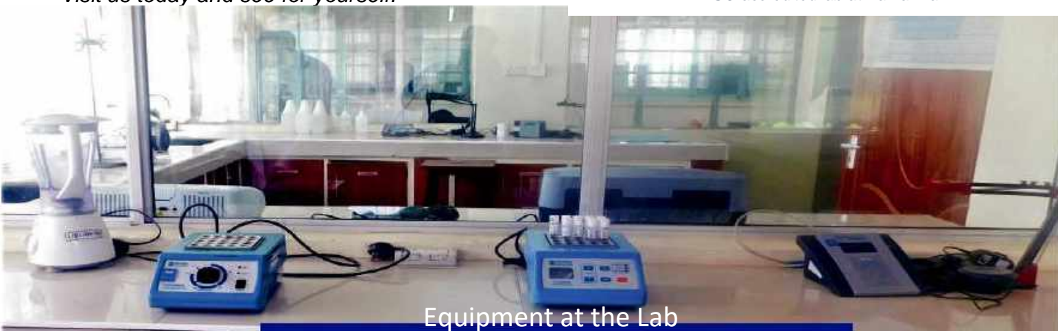
Equipment at the Lab