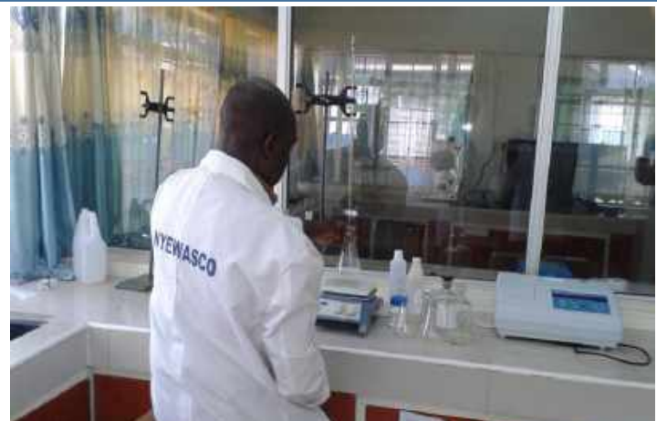
ISO accredited lab at Kamakwa