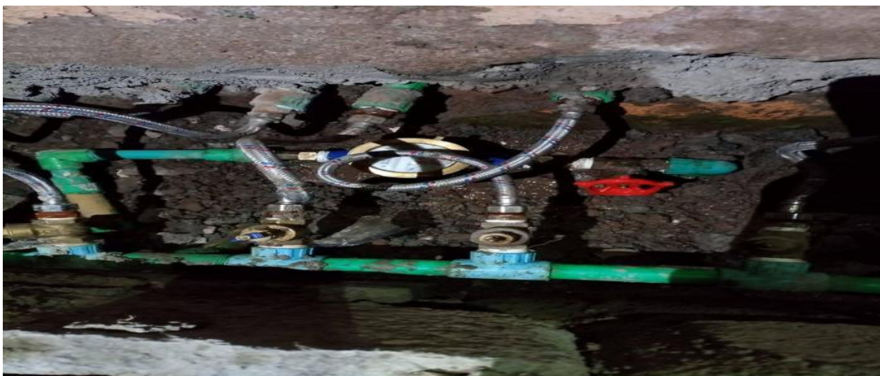
An example of an illegal connection

Let's stop mwizi together. Help us serve you better.