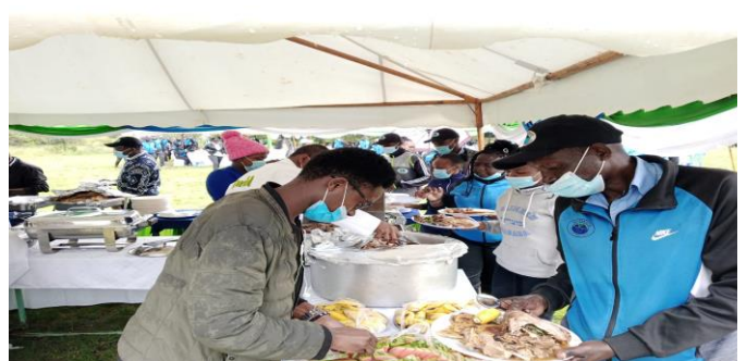
Sights and sounds of the Tree growing and staff end of year lunch at Gatei Sewer Treatment Plant on 22 nd December

Off Kenyatta Road, Behind Nyeri County Fire Offices, P.O. Box 1520-10100 Nyeri Kenya Tel 061-2034548/4623/4622/4617/ 0722-461359/0734-732481: Fax 2032734 - Email info@nyewasco.co.ke - Website www.nyewasco.co.ke