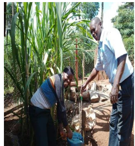
Service line upgrade process in Ithenguri