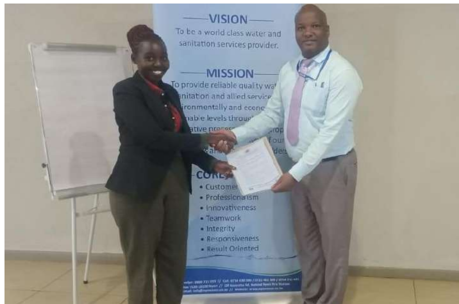
Right: The MD handing over a letter of recommendation to one of the graduating interns