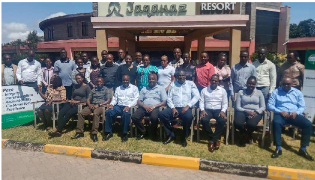
NYEWASCO Staff pose for a photo together with trainers from KENAS during the ISO/IEC 17025: 2017 Training

Maintaining the ISO/IEC 17025:2017 standard accreditation reflects NYEWASCO's dedication to meeting internationally recognized quality benchmarks in laboratory operations. By adhering to this standard, the company strives to provide reliable and accurate testing and calibration services, instilling confidence in its customers and stakeholders.