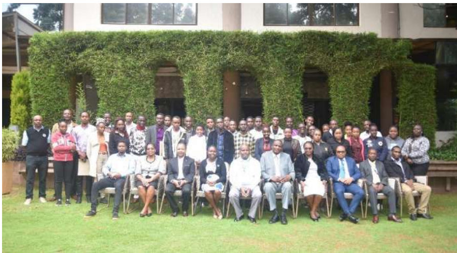
Left: The second cohort of interns pose for a photo together with the Management

Congratulations to the second cohort of interns! May you continue to shine brightly and achieve great success in all your future endeavours.