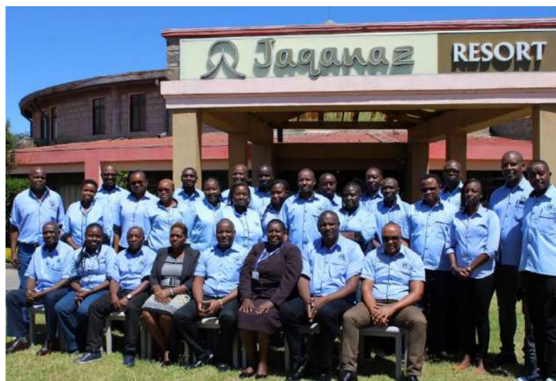
NYEWASCO Staff pose for a photo together with trainers from KEBS during the ISO 9001:2015 Training

The training initiatives implemented across different departments demonstrate NYEWASCO's dedication to maintaining a culture of continual improvement and excellence. By strengthening the capabilities of its workforce, the company aims to enhance customer satisfaction, optimize its internal processes, and uphold the ISO 9001:2015 standard's principles of quality management.