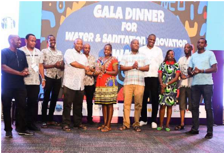
Left: NYEWASCO team receiving a trophy for being ranked at Position 1 in the Non-Revenue Water Challenge from WASPA