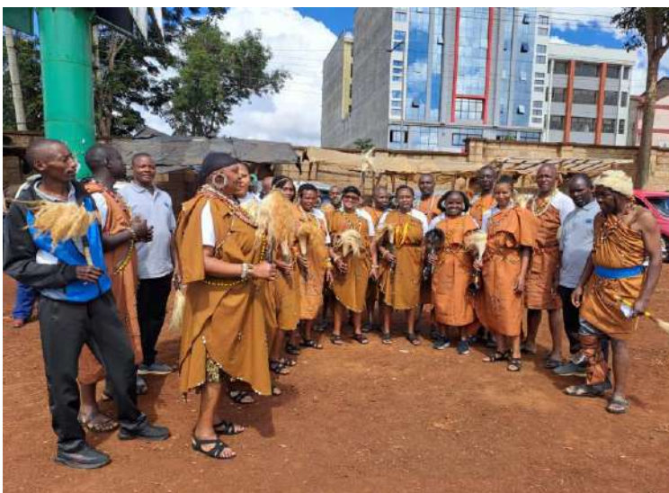
NYEWASCO Cultural Dance team pose for a photo during the celebrations

During the month, the Company Cultural Dance team enthusiastically participated in the Nyeri Madaraka Day celebrations, which were held at Kamukunji grounds in Nyeri Town. Their captivating performance left the audience in awe, as they showcased their exceptional expertise in singing and dancing.