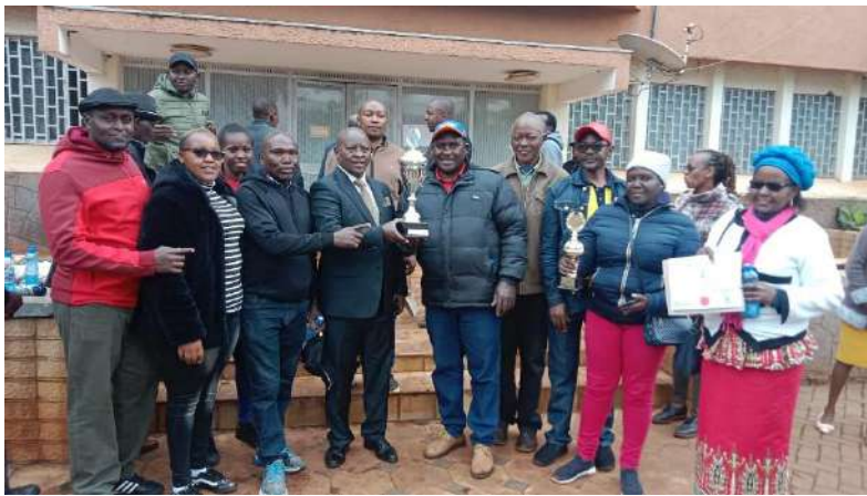
Left: NYEWASCO SACCO Board and Supervisory Committee Members pose for a photo with the Governor during 2023 Ushirika day celebrations