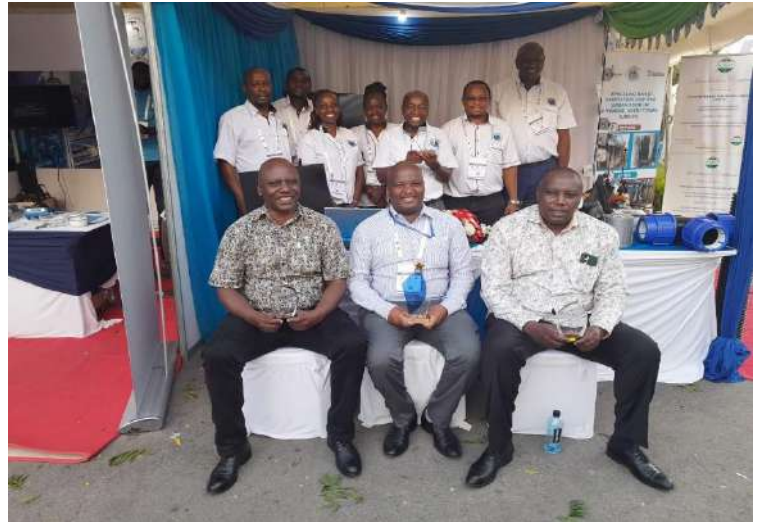
Right: Nyeri Water, Irrigation, Environment and Natural Resources CECM, the Chairman, NYEWASCO B.O.D, M.D, CMTS, CMCS and staff members celebrating NYEWASCO wins after the launch of Impact No. 15