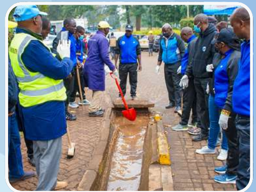
Nyewasco staff members taking part in the clean up exercise