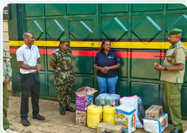
Donation of food stuffs to Nyeri Medium Prison.