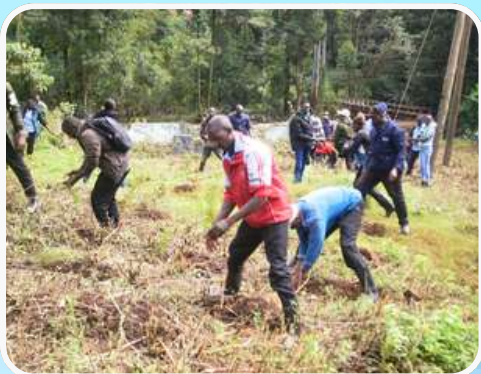
Nyewasco staff members during a tree planting session