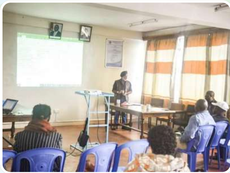
ACAG meeting at Conference Hall

Nyewasco and the Aberdare Conservation Action Group (ACAG) co-hosted the Chania River stakeholders meeting at the Nyewasco conference hall on the 17 of July 2024.