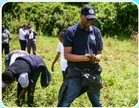
Nyewasco staff members during a tree planting session