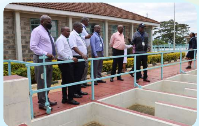
TWWDA Board Members tour Kamakwa Treatment Plant

This visit marks another milestone in our shared vision of delivering clean water and better sanitation to our communities. By working together, we remain committed to bridging gaps, improving infrastructure, and fostering innovations that will enhance the quality of life for those we serve.