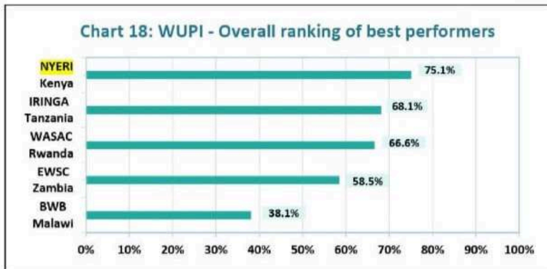
Congratulations to Nyeri WSP of Kenya for emerging the overall best of the best performers for 2021/22 with a total score of 75.1% followed by Iringa WSSA of Tanzania in second place.

During the month of February, the Company was ranked as the best of the best performing water service providers in Eastern and Southern Africa by Eastern and Southern Africa Water and Sanitation (ESAWAS) Regulators Association. ESAWAS is a network dedicated to promoting effective water supply and sanitation regulation through regional cooperation.