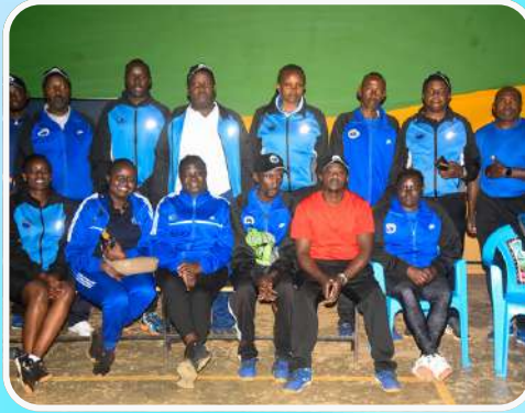
The Nyewasco Table Tennis team at the 13th edition WASCO games