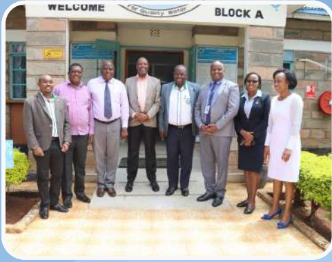
A group photo during the TWWDA courtesy visit