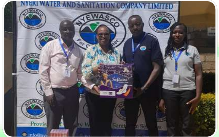
Donation to Rotary club Nyeri Sunshine Rally 2024