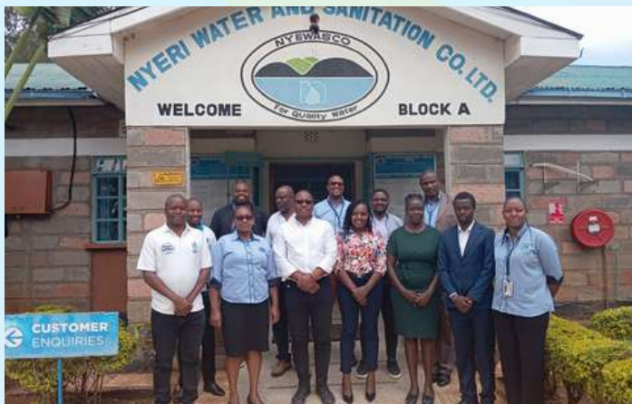
Malawi Northern Region Water Board