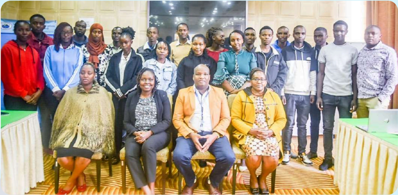
The third cohort of interns pose for a photo together with the Management.