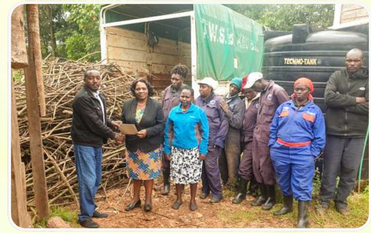
Donation of firewood to schools