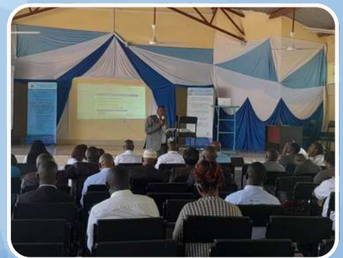
Participants at the Licensing public consultation meeting