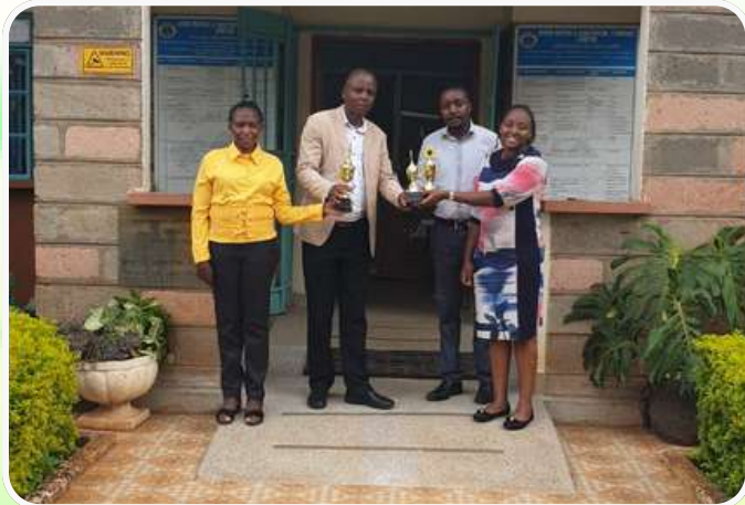
Mathira Education Day support