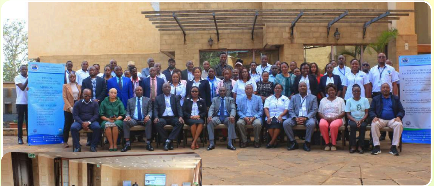
Board Members, Nyewasco staff and Stakeholders pose for a group photo outside White Rhino Hotel