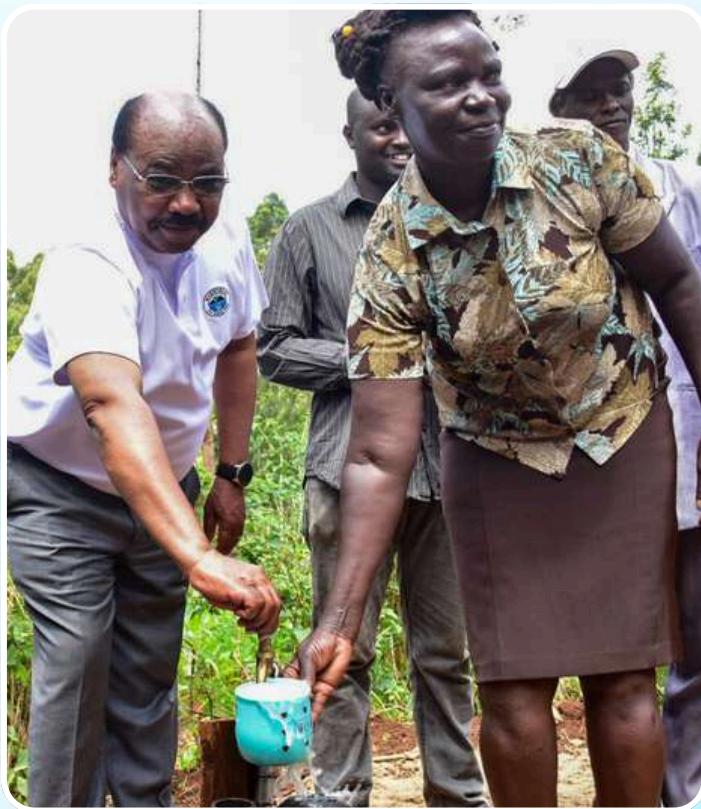
Deputy Governor H.E. Kinaniri with residents during the launch of the domestic water supply project

Residents of Chania Village in Githiru Ward, celebrated a transformative milestone following the launch of a domestic water supply project that provided clean, running water to over 40 households. For years, the community had depended on the Chania River, often walking long distances to fetch water for their domestic needs.