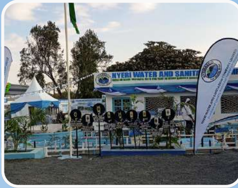
Nyewasco stand at the Central Kenya ASK Show