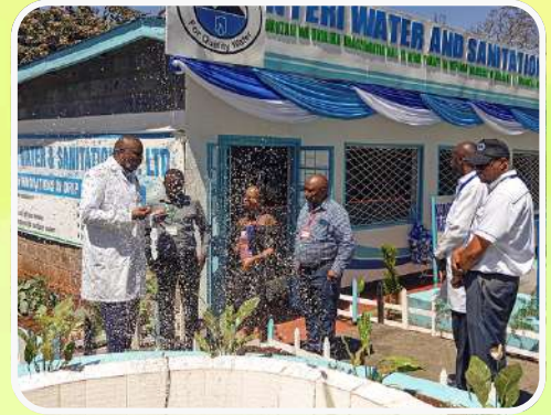
Chief manager Technical Services during the 2024 ASK Show