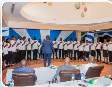
The Nywasco choir making a presentation at the launch of the strategic plan