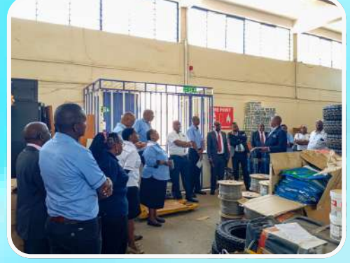
A section of the delegation at the Nairobi water benchmark.