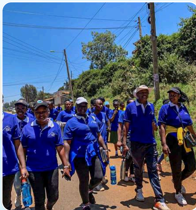
Nyewasco Staff during the 2024 Nyeri Hospice Walk

As participants walked through the streets of Nyeri, their steps carried not only hope for those in need but also a powerful message no one should have to face terminal illness alone or without proper care. The funds raised from this event will go directly to Nyeri Hospice, enabling them to continue providing essential services, including pain management, counseling, and emotional support for patients and their families.