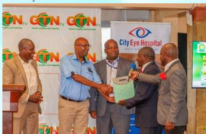
The BOD Chair and the MD receive a souvenir from the GTN Team

The Nyeri Business Leaders Breakfast Forum was an event that brought together corporates leaders and the business community within Nyeri County. It was organized by GTN TV as a part of the County Business Week. The Company was the platinum sponsor of the event. The forum provided a platform for discussions on leadership and business development.