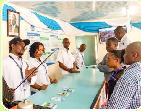
Staff members making a presentation during the 2024 ASK Show