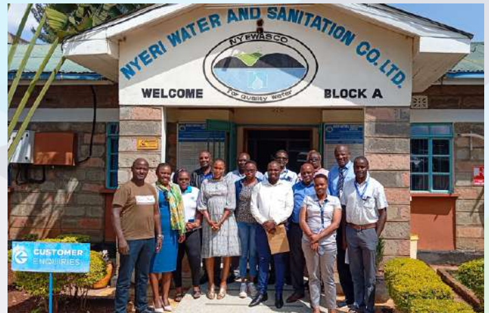
Murang'a County Assembly