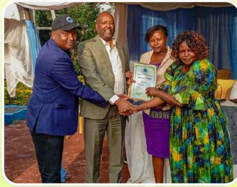
Board Chair and MD handing over a certificate to a retiree