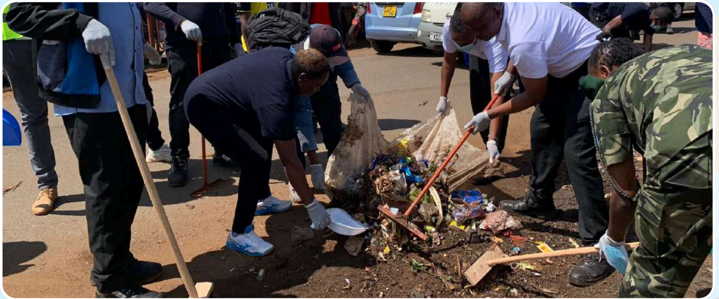
Nyewasco staff during the town clean-up exercise

Mahatma Gandhi once said, “The best way to find yourself is to lose yourself in the service of others.” This profound sentiment perfectly encapsulated the spirit of our end-of-year celebrations as we took to the streets for a Town Clean-Up Exercise on December 11, 2024. This was in collaboration with the County Government of Nyeri and the Nyeri Municipality, as part of our ongoing commitment to Corporate Social Responsibility (CSR), aimed at fostering a cleaner and healthier environment for Nyeri Sub-County.