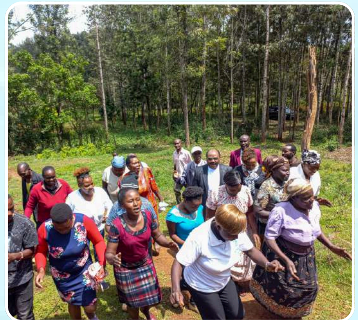
Residents welcome the Deputy Governor H.E. Kinaniri to their homestead

The joyous occasion was marked by celebrations, as residents expressed their gratitude and optimism for a brighter future. The project is expected to not only ease the daily challenges of water access but also promote better sanitation and hygiene in the village.