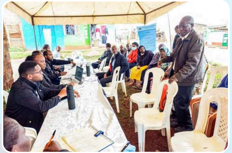
Customer sensitization exercise at Kangemi

In Kangemi, the team addressed common issues such as billing queries and service interruptions, ensuring that customers had a clear understanding of how to resolve these problems.