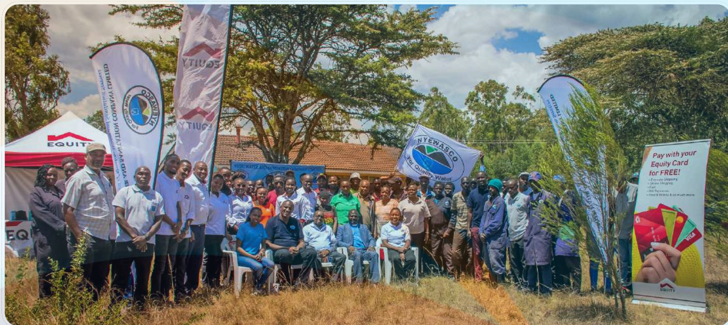
Group photo of participants during the drive.

World Water Day is observed annually on March 22nd and serves as a global observance aimed at raising awareness about the importance of freshwater and advocating for sustainable management of water resources. The United Nations General Assembly declared March 22nd as World Water Day, starting in the year 1993.