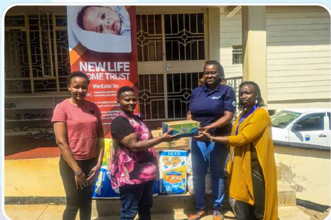
Donation of food stuffs to Newlife Home trust.