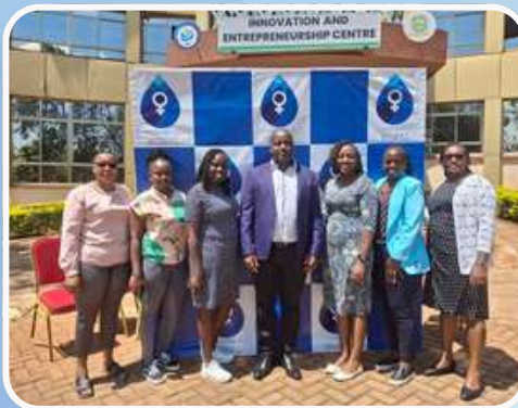
MD and staff members at the WIWAS Meet and Greet event