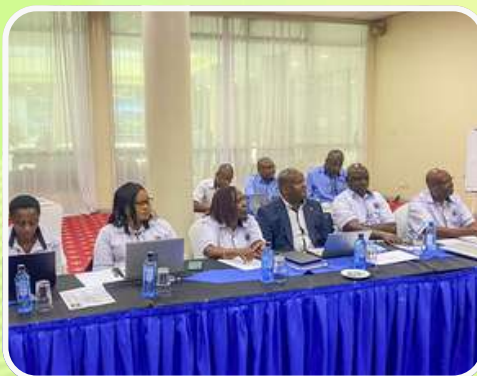
A section of the delegation at the Nairobi water benchmark.