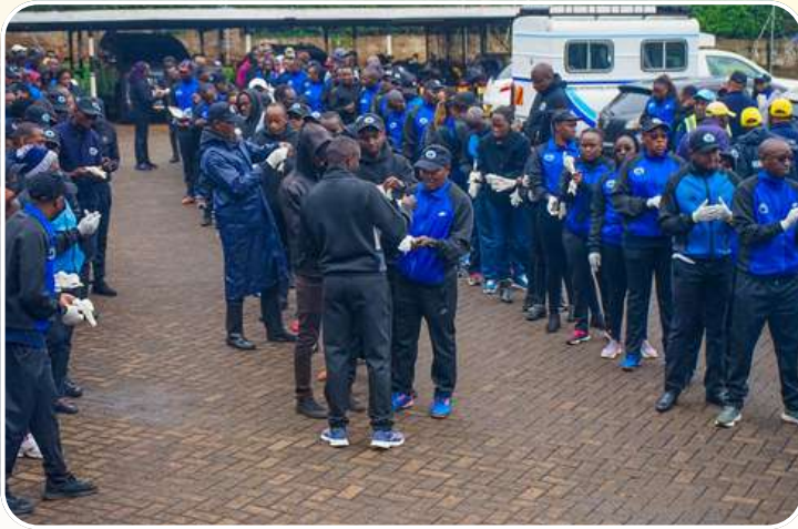
Nyewasco staff in lines preparing to head off to the town clean up exercise

On September 6, 2024, Nyewasco organized a town clean-up exercise, emphasizing the company's commitment to environmental stewardship and community engagement. The event brought together County Government of Nyeri, staff members, local residents, and various stakeholders, all united in a common goal of enhancing the cleanliness and beauty of our surroundings.