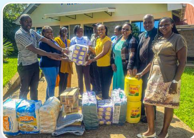
Donation of food stuffs to Nyeri Hospice.