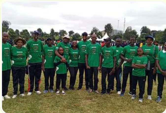
Mater Heart Run