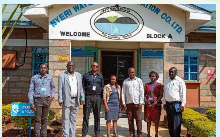
Chemususu Water Company