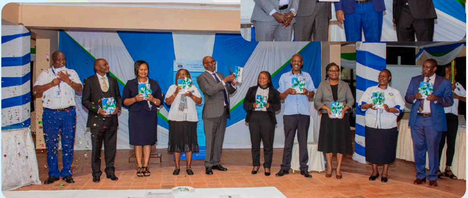
The Board of Directors, The Managing Director and the Company Secretary receive the official strategic plan document during the launch