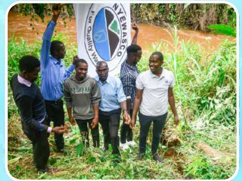
Young water professionals at a tree planting event