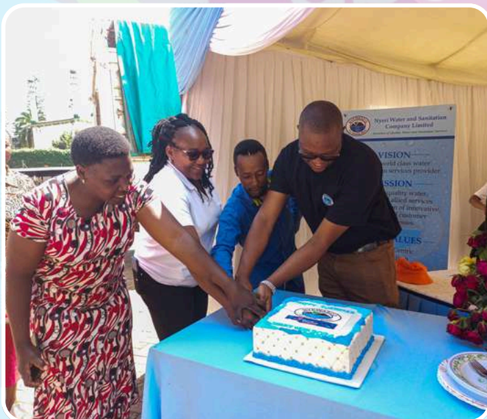
Nyewasco staff and customers cut a cake to mark the end of a great customer service week

At Nyewasco, we are driven by the principle of putting our customers first, and we remain steadfast in our commitment to going Above & Beyond in every interaction. As we look to the future, we are excited to deepen our partnership with our customers, striving to provide service that not only meets but exceeds their expectations.