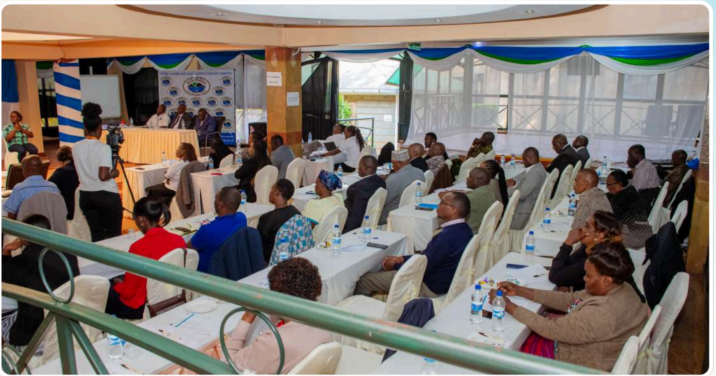
A section of Stakeholders actively participating in a plenary session during the Stakeholder's meeting at White Rhino Hotel.

NYEWASCO continued its tradition of fostering dialogue and collaboration at its annual stakeholders' conference, held on June 3rd at the White Rhino Hotel. Representatives from diverse sectors, including government agencies, community organizations, environmentalists, and industry experts, gathered for a day dedicated to advancing the provision of quality water and sanitation services.