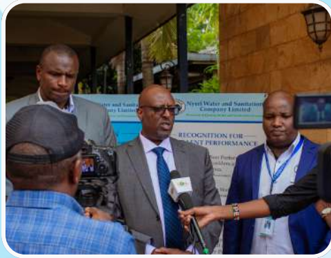
The Board Chair and The MD during an interview