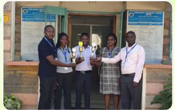
Kieni Education Day support