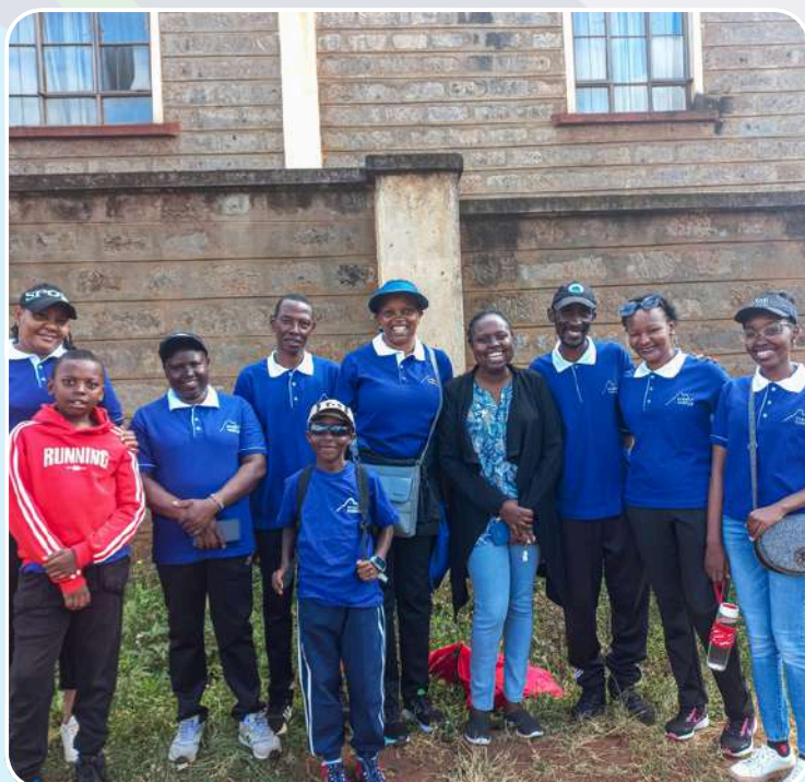
The team that represented Nyewasco at the 2024 Nyeri Hospice Walk

Nyewasco staff proudly joined hundreds of other participants in the annual Nyeri Hospice 10km charity walk, an event deeply rooted in the community and dedicated to supporting terminally ill patients. This meaningful initiative, held every year, aims to raise crucial funds for palliative care services, while also fostering greater awareness around the importance of compassionate care for those facing life-limiting illnesses. The event attracted a diverse group of local leaders, community members, healthcare professionals, and volunteers, all united by the shared goal of advocating for enhanced healthcare services in the Nyeri region. Their collective presence emphasized the critical need for stronger support systems for the patients, demonstrating the power of community when it comes to addressing pressing social and health challenges.