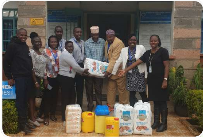
Donation to the Islamic Community for Eid Al Fitr

Corporate social responsibility (CSR) refers to strategies that companies put into action as part of corporate governance that are designed to ensure the company's operations are ethical and beneficial for society. The Company has been a beacon of Corporate Social Responsibility (CSR) in its operations. The company's CSR initiatives are deeply rooted in its core values. During the quarter the Company took part in several CSR initiatives.