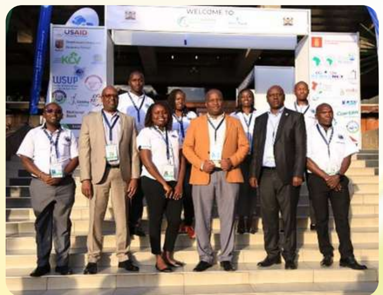
NYEWASCO team pose for a photo during the WASIC conference

By the end of the conference, numerous networks had been established, promising significant benefits for the company in the years to come and enhancing resource mobilization.