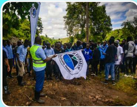
The MD flagging off a tree planting event