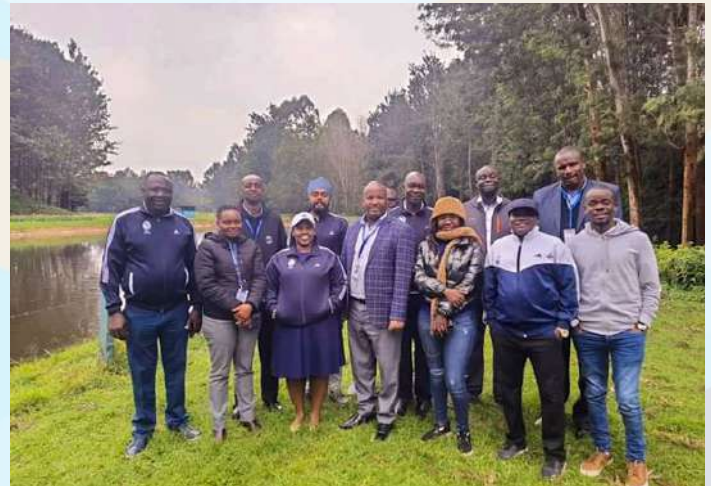
Kisumu Water and Sanitation Company