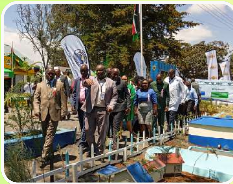
Governor Mutahi Kahiga during his visit of our Stand at the ASK show