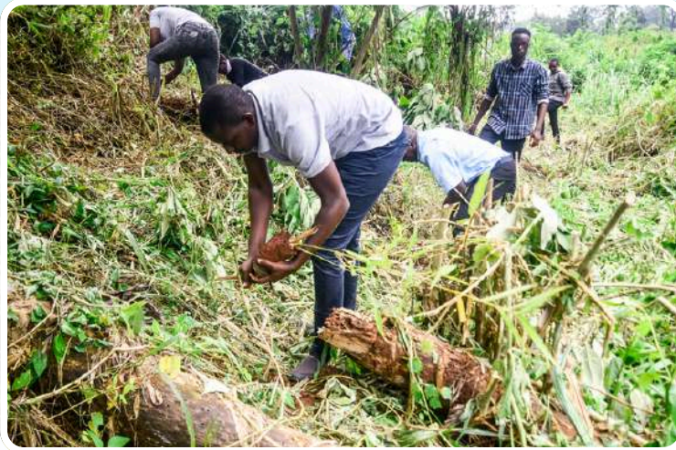
Participants during the tree planting session at Kangemi Sewer Treatment Works.

Earth Day is an international day celebrated on 22 April and is devoted to our planet. It draws attention to the environment and promotes conservation and sustainability. It is celebrated to create awareness among people to solve various problems like climate change and pollution, activate various environment movements and awareness programs, conserve natural resources, protect endangered species, and move towards a sustainable future.