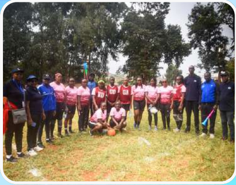
The Nyewasco ladies netball team at the 13th edition WASCO games