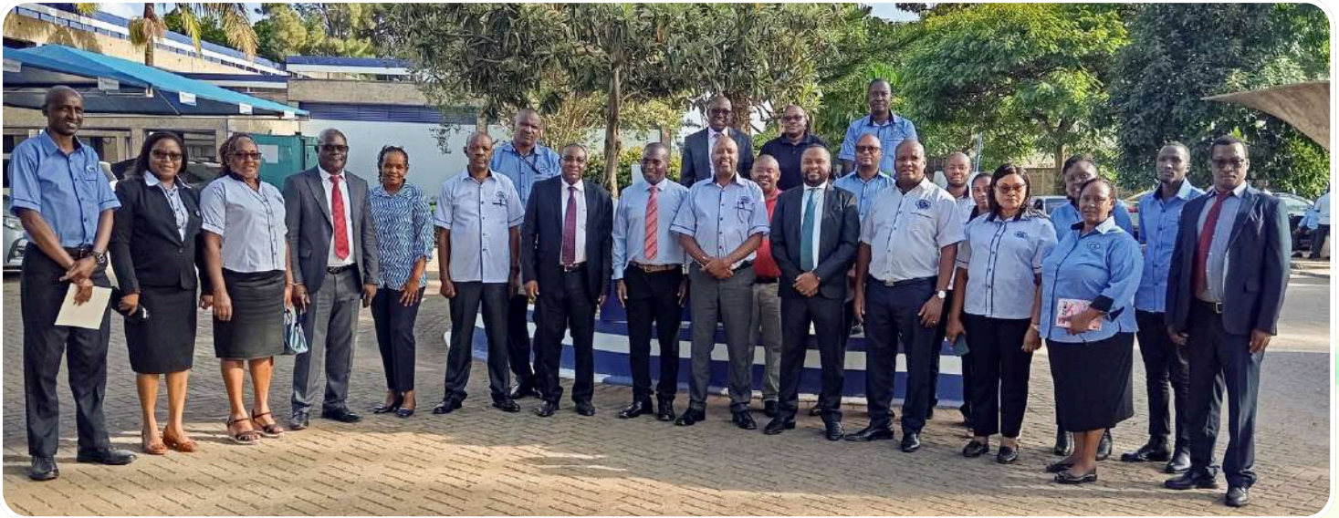
The delegation that represented Nyewasco pose for a group photo with the team from Nairobi Water Company

In a bid to enhance operational efficiency and improve service delivery, we recently completed a two-day benchmarking visit to Nairobi City Water and Sanitation Company (NCWSC). The visit provided a valuable platform for knowledge exchange, with a particular focus on best practices in water and sanitation management.