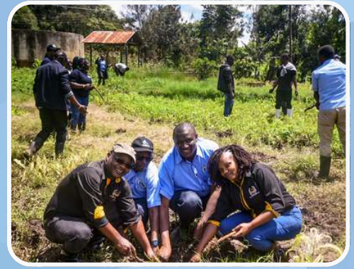
Nyewasco management and Kenya Institute of Management (K.I.M) staff during a tree planting ceremony