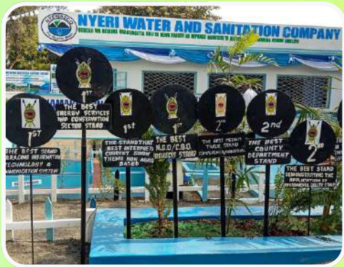
Awards won during the 2024 ASK Show