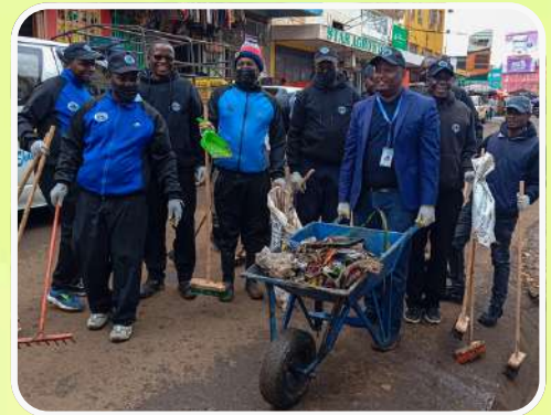
A group of Nyewasco staff during a town clean up exercise