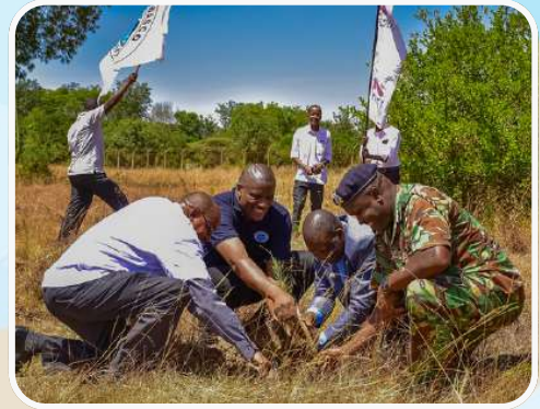
Participants during a tree planting session