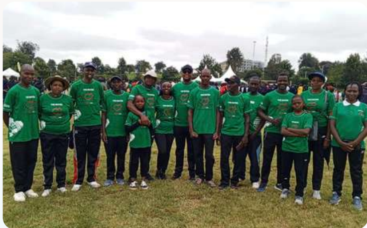
The team that represented NYEWASCO at the Mater Heart Run, 2024 Nyeri Edition.