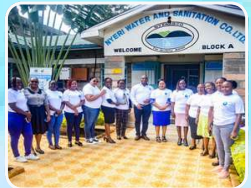
A group photo of WIWAS officials during menstrual hygiene day