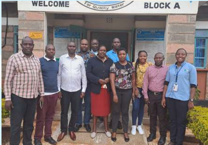
County Assembly of Kericho

For the year 2024, we had the honor of hosting several delegations for benchmarking visits. These visits provided opportunities for knowledge exchange, where we showcased our systems, best practices, and innovations in the water sector. These engagements have been mutually beneficial, as we also gained new perspectives from the visiting teams.