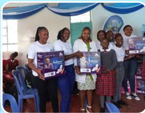
Participants during the Menstrual hygiene day