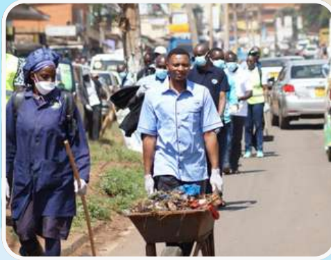
Nywasco staff members during a town clean-up exercise