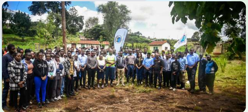
A group photo of all participants in attendance