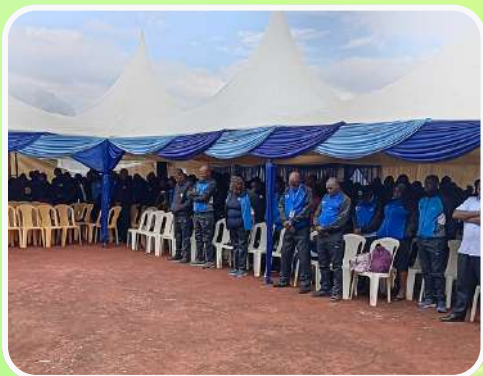
Staff members during the 13th edition WASCO games celebrations