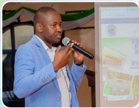
Senior officer ICT during the launch of the new Nywasco website