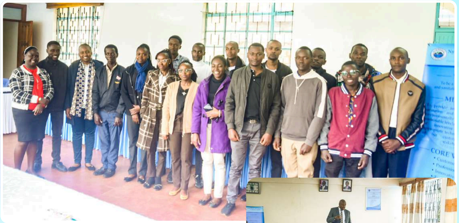
4th Cohort Interns during their induction ceremony

On July 8 2024, Nyewasco proudly inducted its 4th cohort of interns for the 2024/2025 program. The induction ceremony, marked the beginning of an exciting journey for the new interns, who are set to gain invaluable experience and contribute to the company's mission of providing high-quality water and sanitation services.