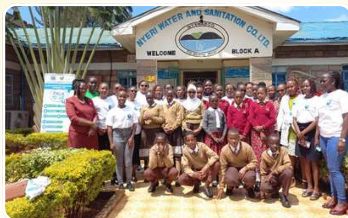
Photo from the WIWAS event held at Nyewasco conference hall to mark Menstrual Hygiene Day.

Each student received a dignity pack containing essential sanitary products, ensuring they could manage their menstrual health with dignity and comfort. This initiative symbolized a step towards eliminating barriers that hinder girls' education due to lack of access to sanitary products. The success of the event highlighted the significant impact that community collaboration can achieve for a noble cause