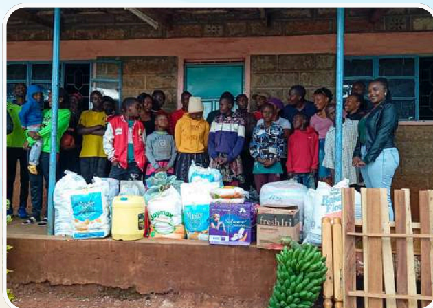
Donation of essential supplies to Huruma Children's Home.