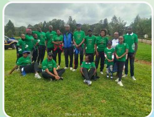
Nywasco staff members at the Matter heart run 2024 edition