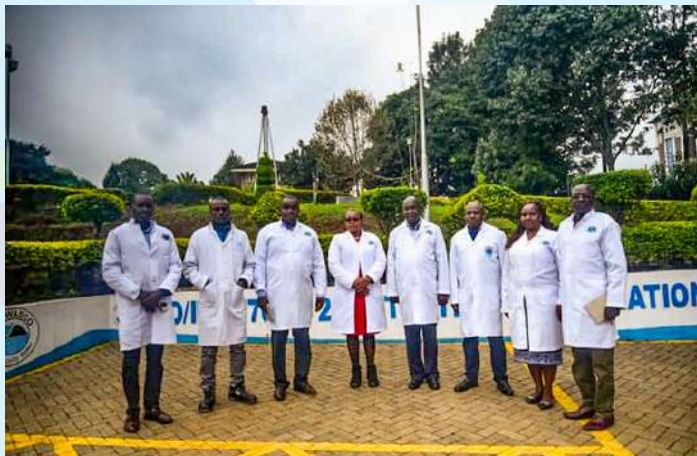
Eldoret Water and Sanitation Company