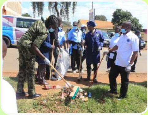
A group of Nyewasco staff during a town clean up exercise