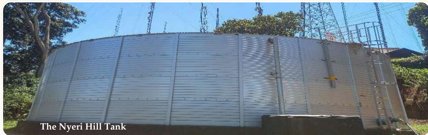
The Nyeri Hill Tank