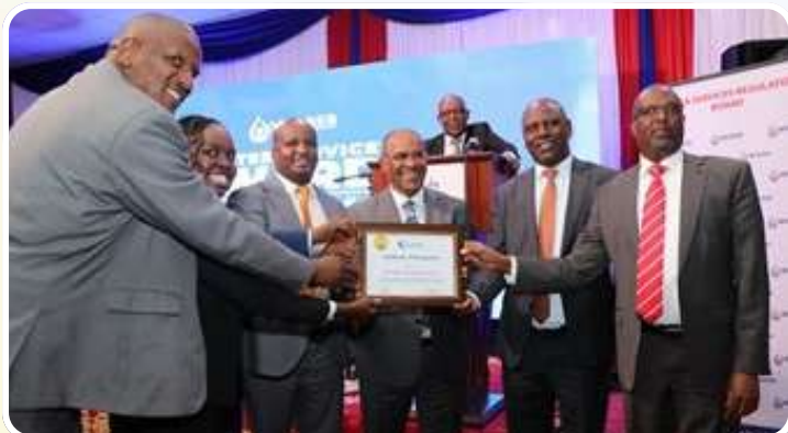
Nyeri Water, Irrigation, Environment and Climate Change CECM, The Chairman, NYEWASCO B.O.D, The Managing Director, Chief Manager Technical Services and Chief Manager Finance and Corporate Services receive a trophy and the ESAWAS certificate of recognition from Hon. Zachariah Njeru, CS, Water, Sanitation and Irrigation

The 16th edition of the Impact Report, titled "IMPACT 16," was launched on June 20th, 2024 by the Water Services Regulatory Board (WASREB) of Kenya.