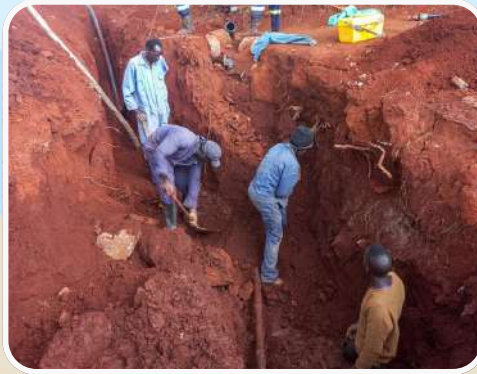
Technical team doing a pipeline maintenance