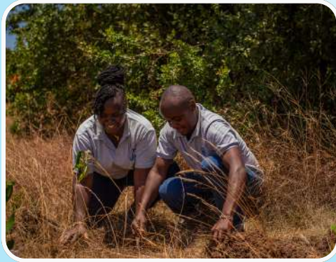
Nywasco staff members during a tree planting session