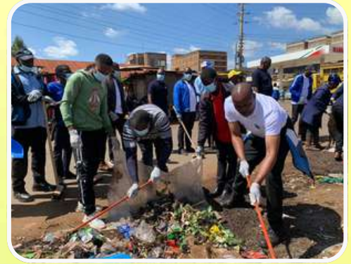
A group of Nyewasco staff during a town clean up exercise