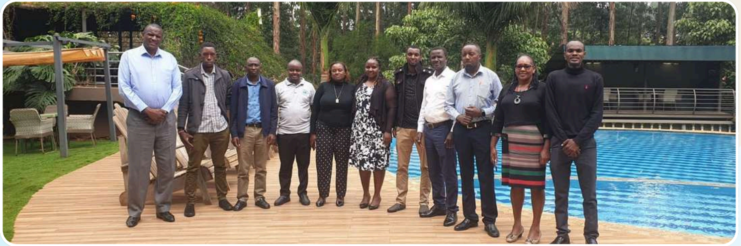
The Occupational Safety & Health Committee members

Our Occupational Safety & Health Committee held a two-day workshop on November 23, 2024, focused on evaluating and addressing safety and health concerns across all company workplaces. The workshop, which brought together key stakeholders, highlighted our unwavering commitment to ensuring the well-being of our employees.