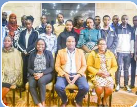
Management and 3rd Cohort Interns during their graduation