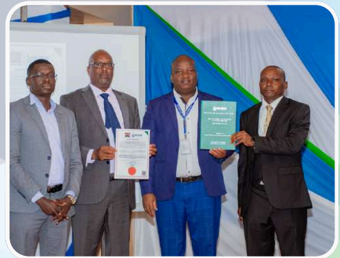
An official from WASREB handing over the 8-year license