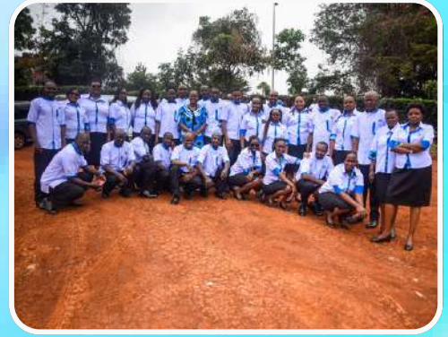
The Nyewasco choir poses for a photo at the 13th edition WASCO games