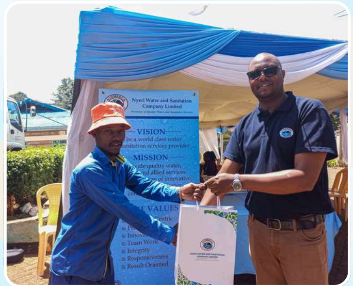
One of the customers who went home with a gift hamper courtesy of customer service week

The culmination of the week-long celebrations was a moment of gratitude, as we came together to express our heartfelt appreciation for the trust and loyalty our customers place in us. As a special gesture, we presented delightful hampers to attendees, further reinforcing our belief that our customers are the heart and soul of our organization.