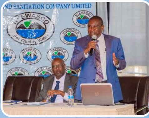
The company secretary making a presentation during the launch of the strategic plan