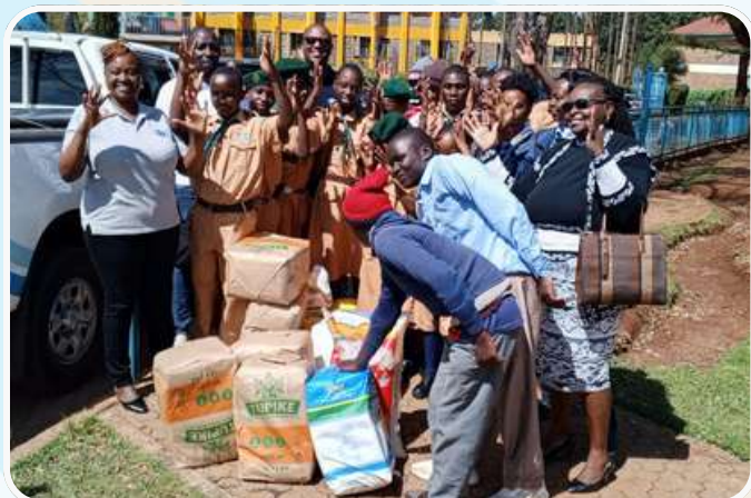
Donation of foodstuffs to various children homes and schools within central region during this year's Thanksgiving harvest organized by Central Kenya ASK Show.