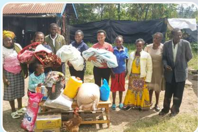
Donation of food stuffs to one of our customers who had just welcomed triplets.