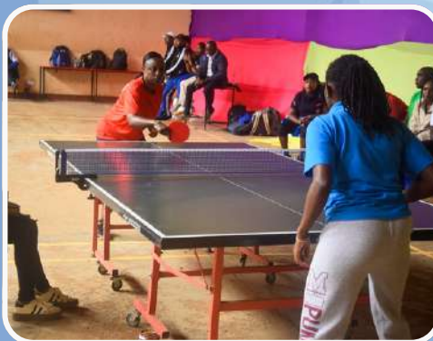
Table Tennis ladies showing their prowess at the 13th edition Wasco Games