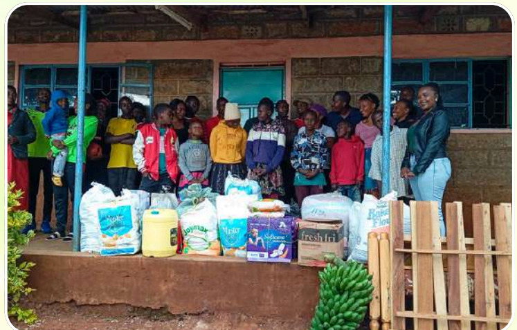
Young water professionals, staff and children at Huruma Children's Home

On September 28, a group of young water professionals made up of the young members of the Nyewasco staff visited Huruma Children's Home in Ruring'u, Nyeri County, to provide support and care for the children residing there. This initiative involved the donation of essential items, including foodstuffs, clothing, toiletries, and other supplies, aimed at improving the living conditions of the nearly 90 children housed at the facility. Huruma Children's Home serves a diverse group of children ranging from primary to college levels. The home prioritizes providing basic needs such as food, shelter, clothing, and education. It aims to create a nurturing environment where children can thrive academically and socially. The visit by the water professionals was part of a broader effort to engage with and support local communities. By donating essential supplies, they aimed to alleviate some of the challenges faced by the children at Huruma.