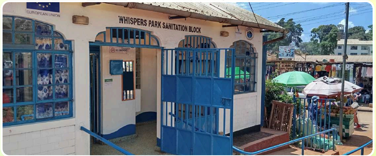
Whispers Park Sanitation Block

On November 19, 2024, Nyewasco proudly emerged as the winner of the Best Toilet Award - Women-Friendly Category at the prestigious WIWAS-TOYA (Toilet and Sanitation Awards) ceremony. The recognition came during this year's celebration of World Toilet Day, a day dedicated to highlighting the importance of accessible and inclusive sanitation for all.