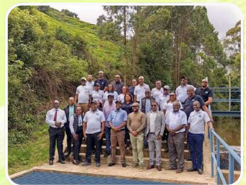
A section of the delegation at the Nairobi water benchmark.